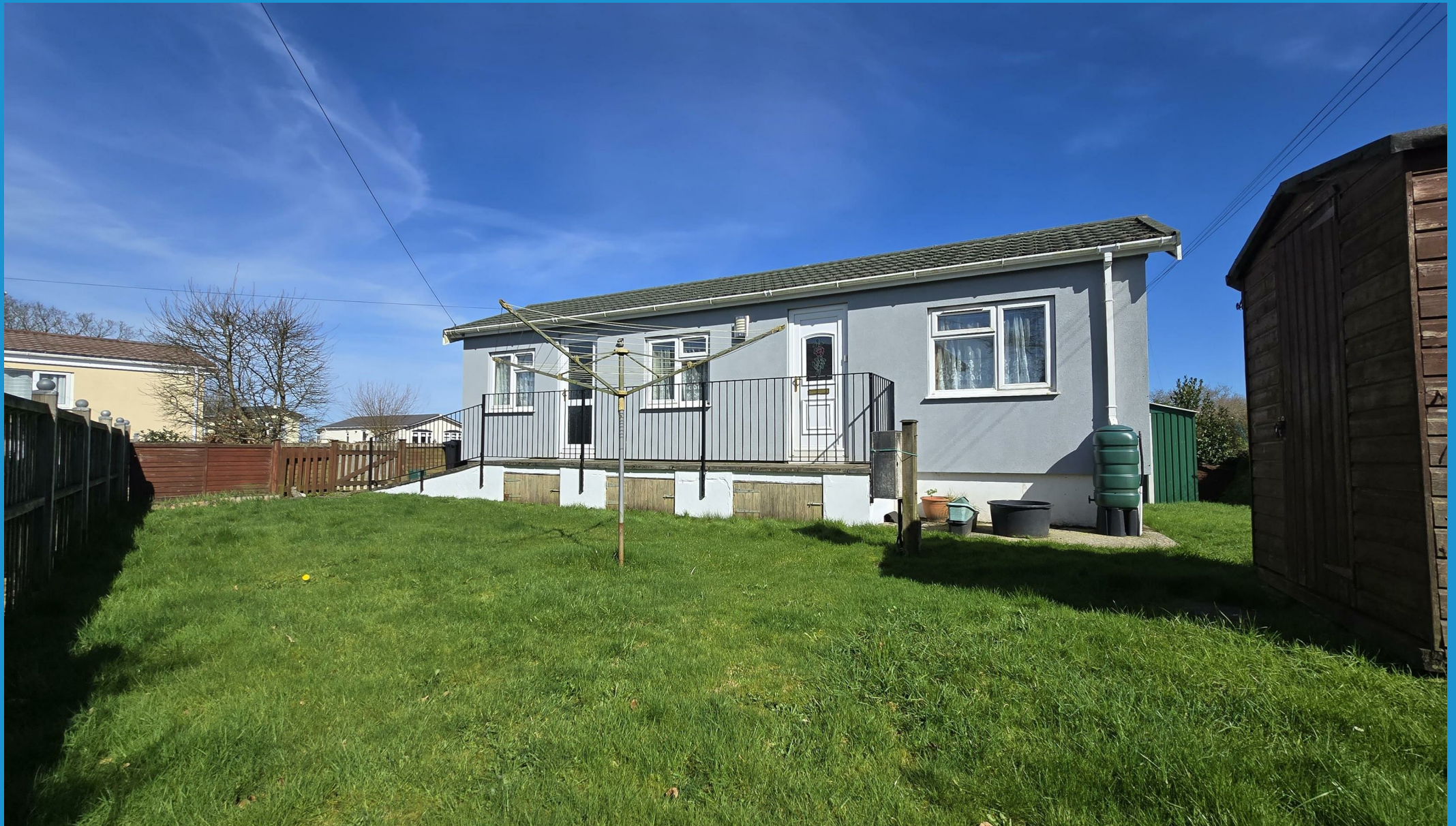
Trekeastle Park Tregadillett | Launceston