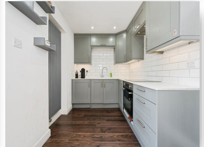
Grainger Gardens, Southampton SO19 0SD