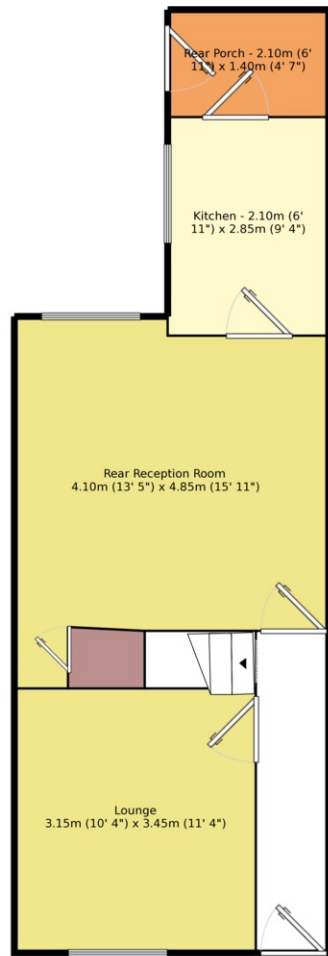
Ground Floor Floor Size: 42.4 m 2 , 456.7 ft 2