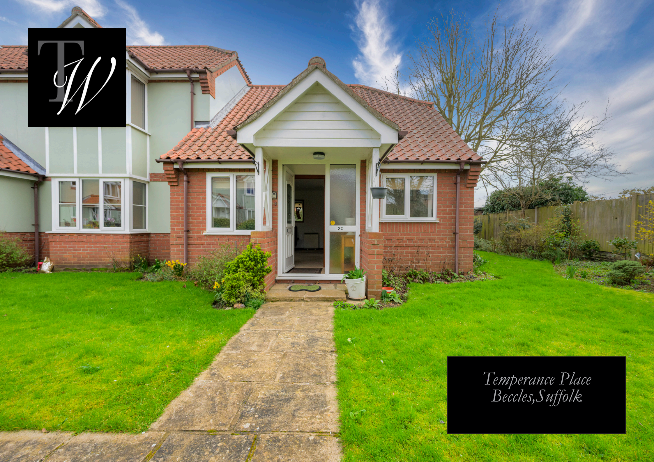
Temperance Place Beccles, Suffolk