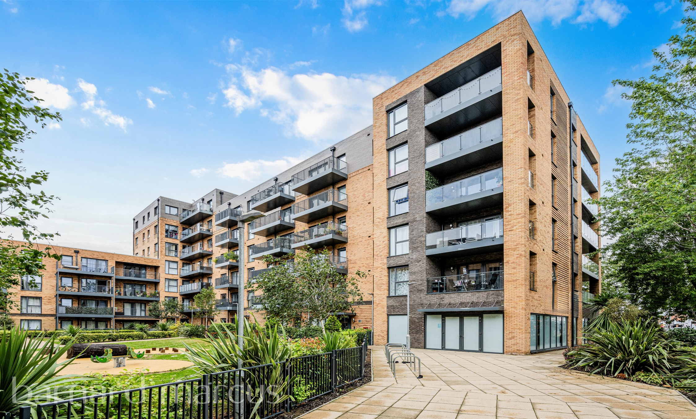
Windermere House, Kingston Road, New Malden, KT3 3FR