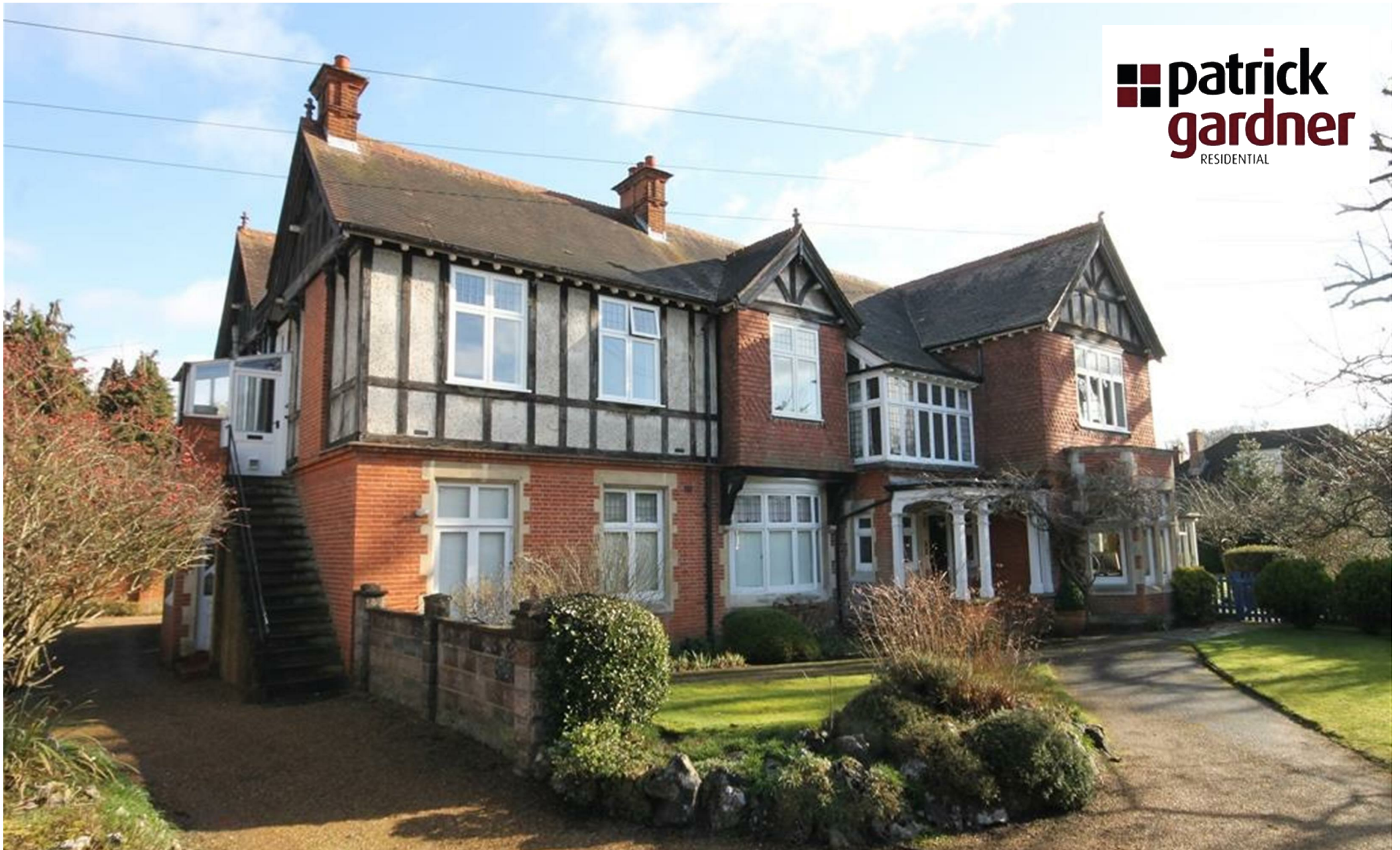
Flat 4 The Old Rectory The Old Street, Fetcham, Surrey, KT22 9Q$share of Freehold - Price Guide £395,000