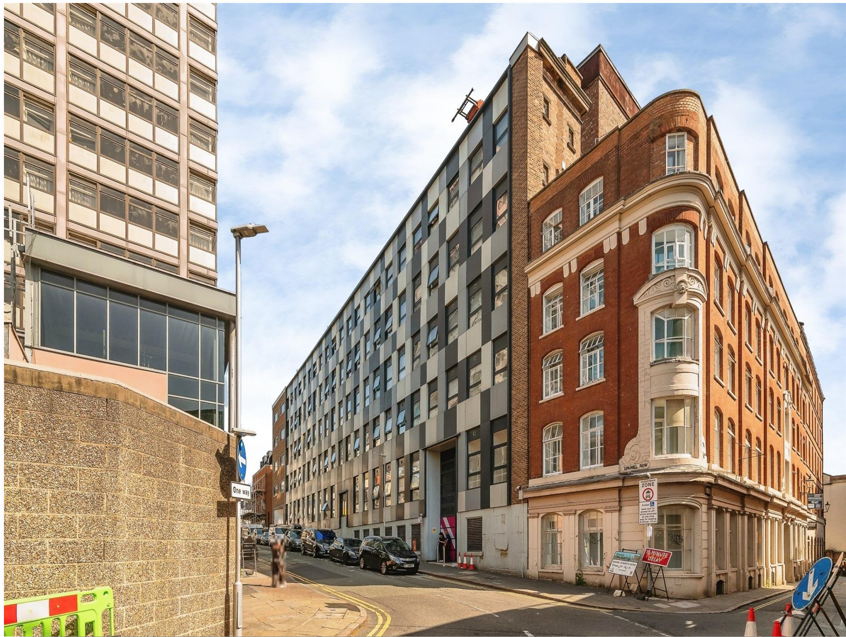
Minerva House Spaniel Row, Nottingham NG1 6EP