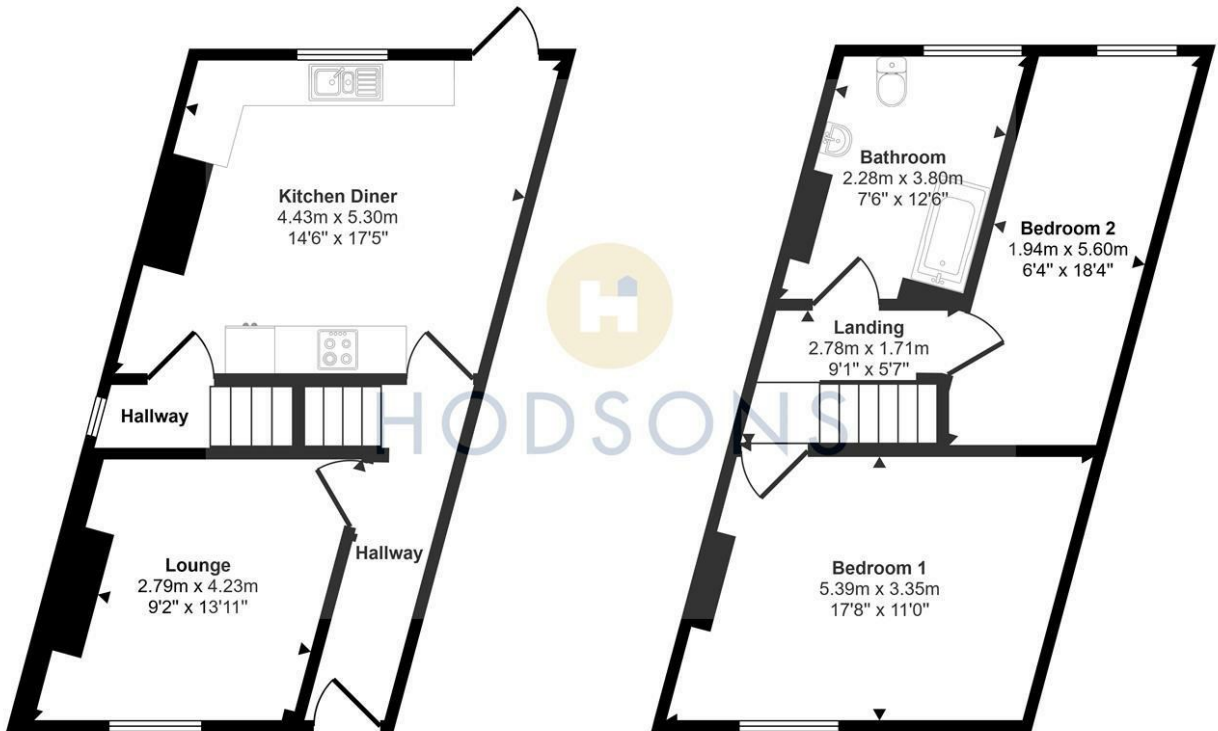
Ground Floor Approx 39 sq m / 415 sq ft

Approx Gross Internal Area 77 sq m / 825 sq ft