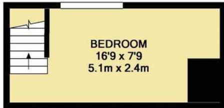
2ND FLOOR APPROX. FLOOR AREA 122 SQ.FT. (11.3 SQ.M.)