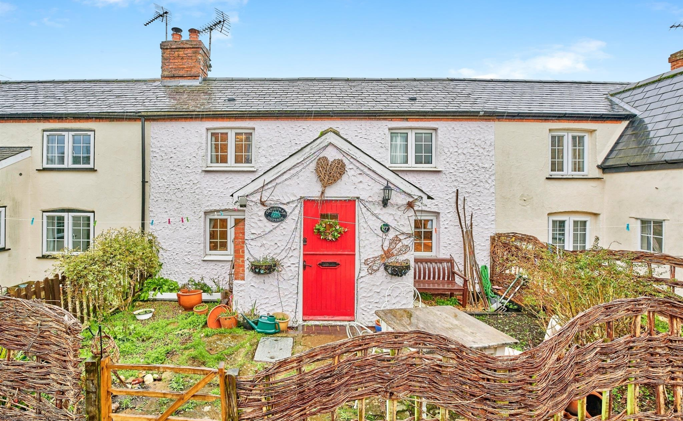
Christmas Cottage, High Street, Chrishall, Royston £300,000 Freehold