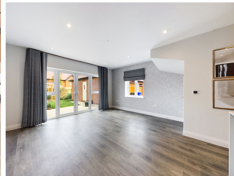
Aspen Road, High Wycombe, Buckinghamshire, HP10 9FA