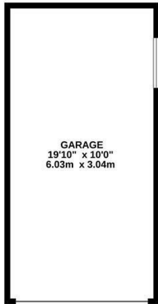
GROUND FLOOR 197 sq.ft. (18.3 sq.m.) approx.