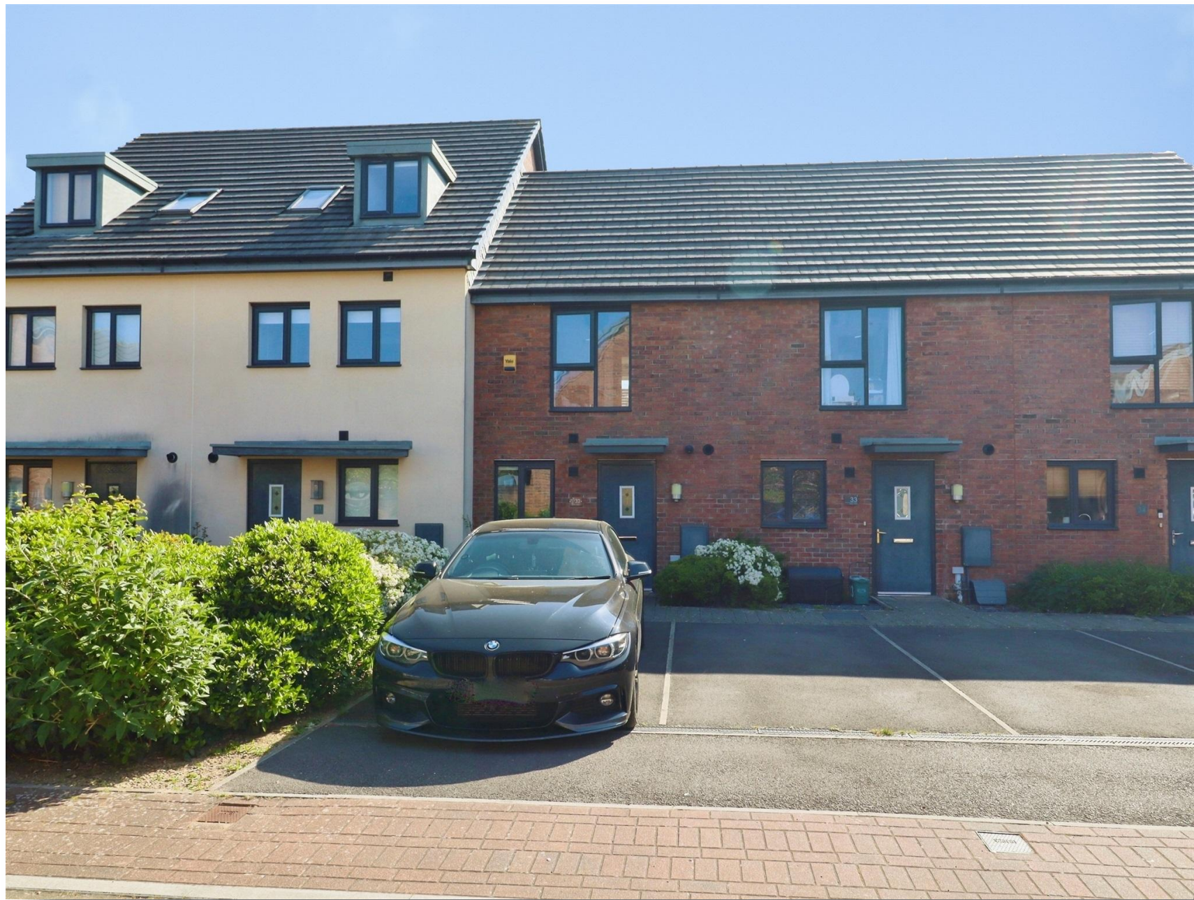
Baruc Way, Barry CF62 5AX