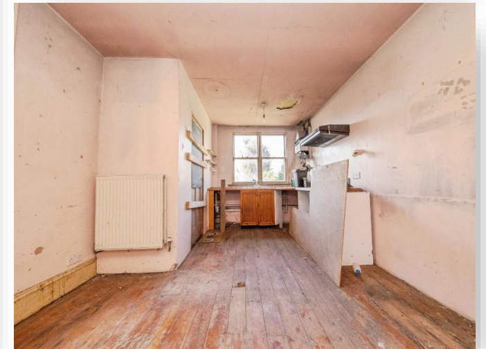
Greenstead Road, Colchester, CO1 2SY