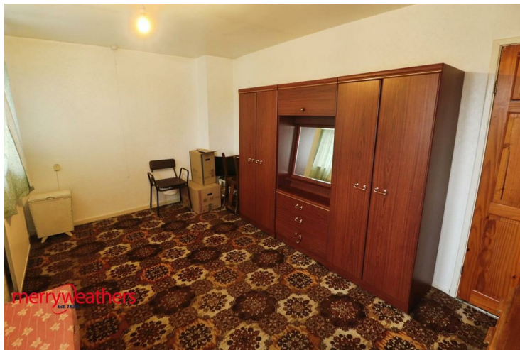
Bedroom One 14'11" x 9'5" (4.57 x 2.89)