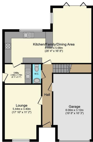
Ground Floor Floor area 85.0 sq.m. (915 sq.ft.)