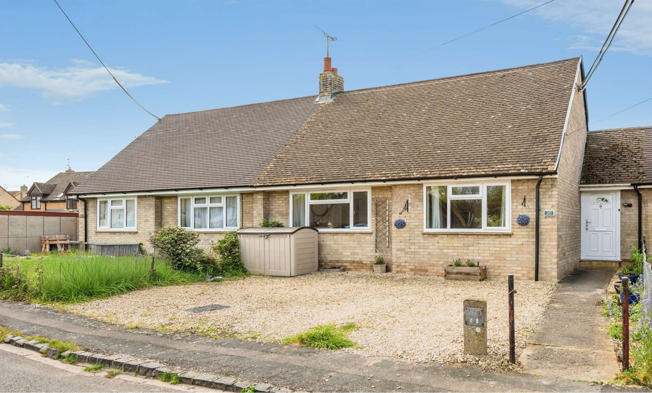
Flexneys Paddock, Stanton Harcourt, Witney, OX29 5RS