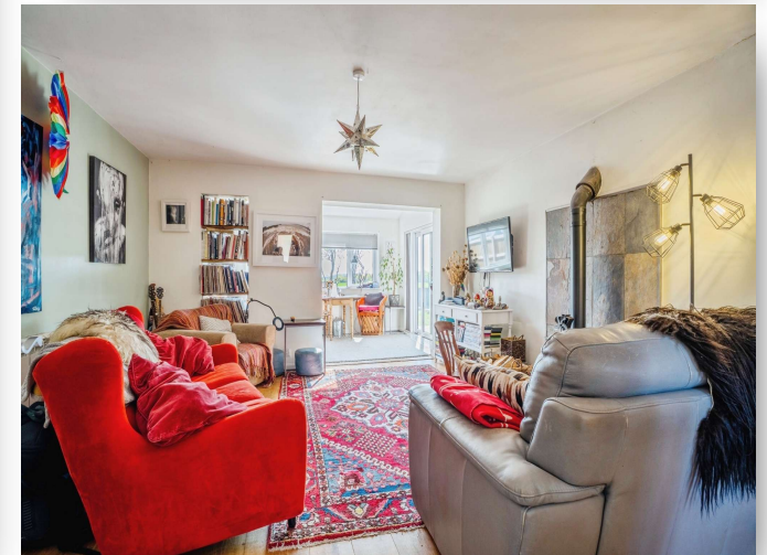
Wingfield Meadows, Stonham Aspal, Stowmarket, IP14 6DG