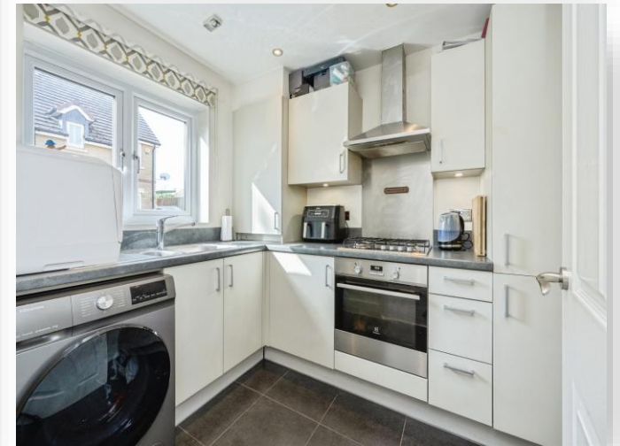
Meadow Way, Wing, Leighton Buzzard, LU7 0TG