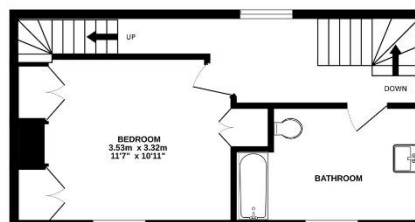
TOTAL FLOOR AREA : 98.5 sq.m. (1061 sq.ft.) approx.

Whilst every attempt has been made to ensure the accuracy of the floorplan contained here, measurements of doors, windows, rooms and any other items are approximate and no responsibility is taken for any error, omission or mis-statement. This plan is for illustrative purposes only and should be used as such by any prospective purchaser. The services, systems and appliances shown have not been tested and no guarantee as to their operability or efficiency can be given. Made with Metropix ©2025