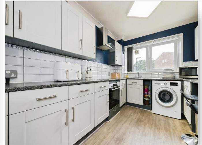
Wadhurst Gardens, Southampton SO19 9QR