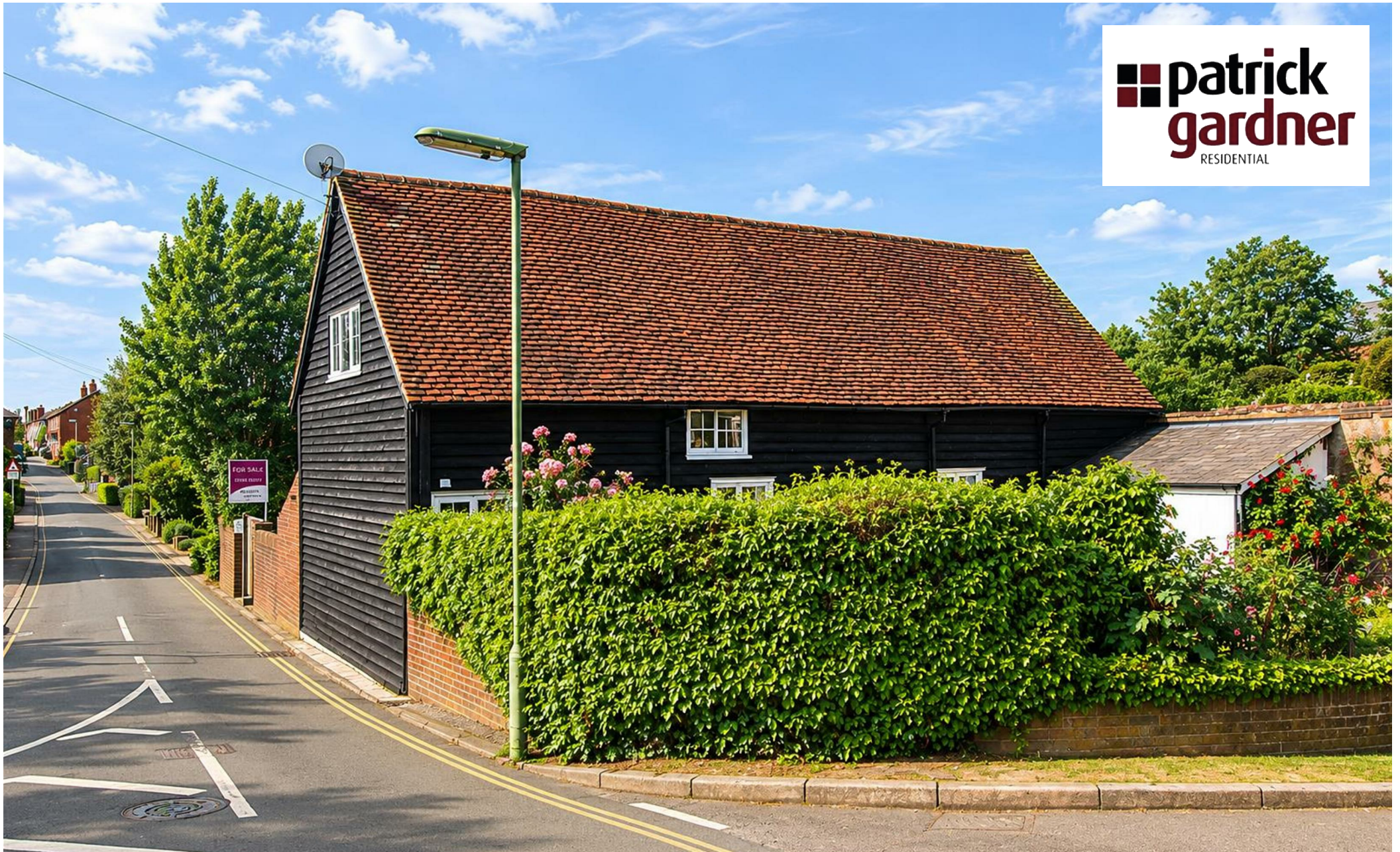
The Barn, Linden Road, Leatherhead, Surrey, KT22 7JF