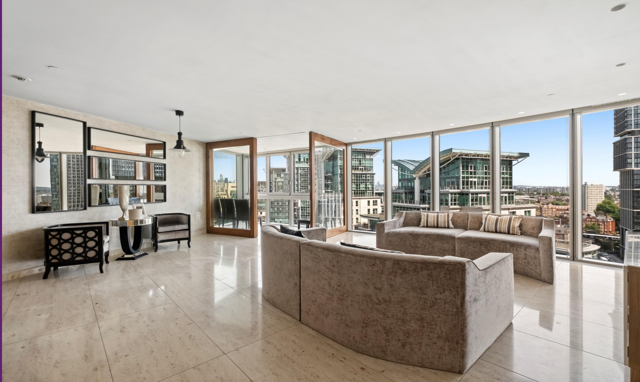
The Tower 1 George Wharf, SW8