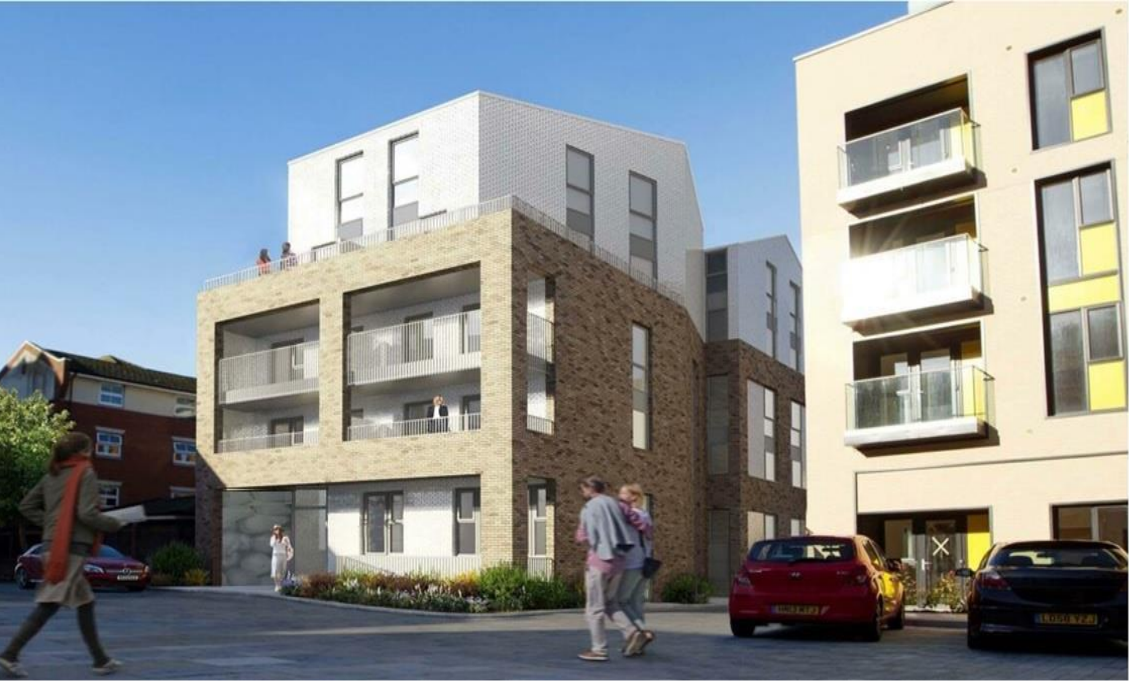
The Old Fruit Market, Back of The Walls, Southampton SO14 3BY