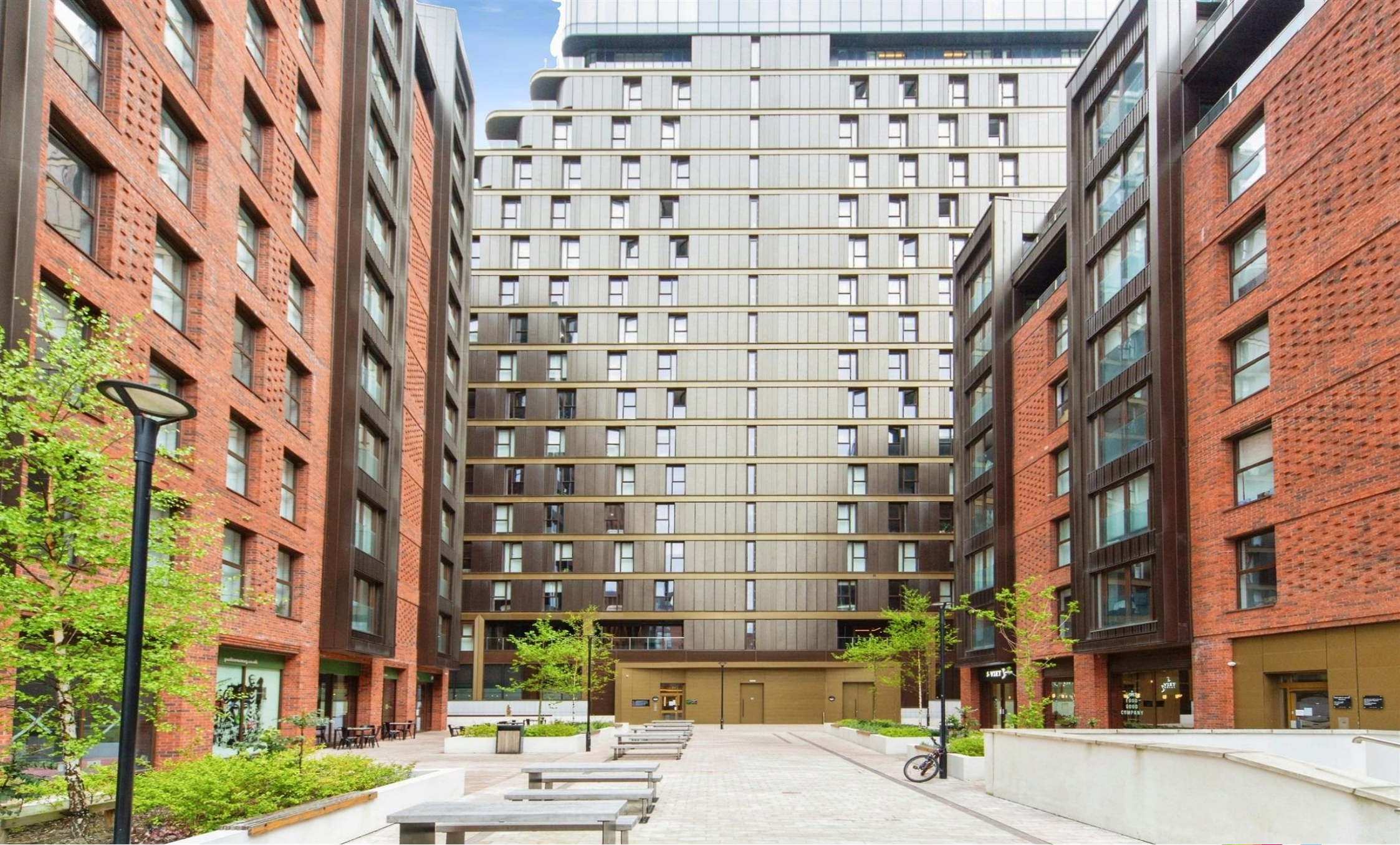
Crump Street, Liverpool L1 0DQ