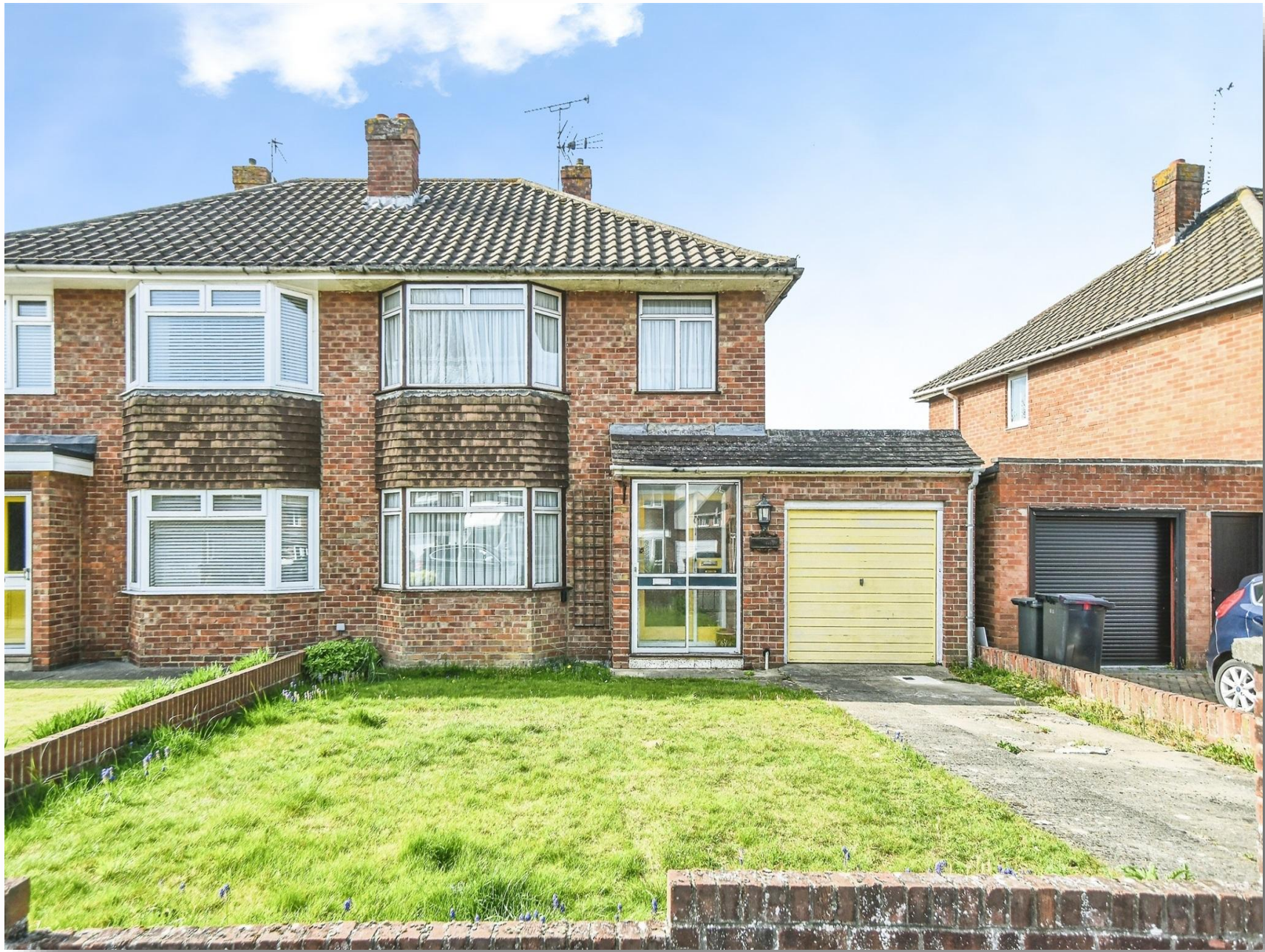
Grange Drive, SWINDON, SN3 4JX