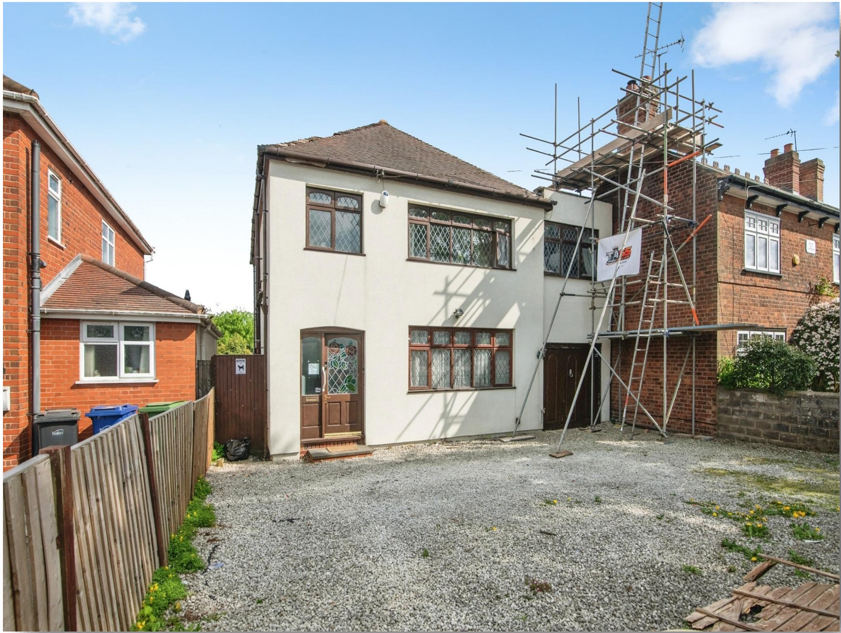
Bath Street, Sedgley Dudley DY3 1LR