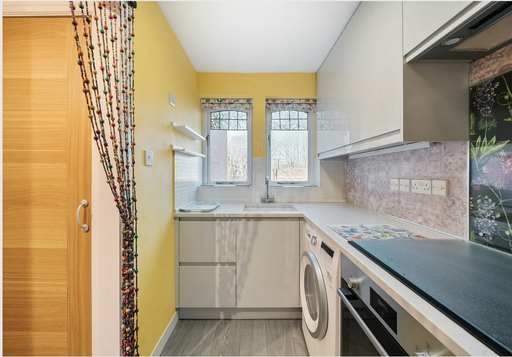
A recently refurbished and redecorated first floor one bedroom apartment in the heart of Horsley village, conveniently located for the station, local shops and outside spaces. Offered to the market with No Onward Chain.