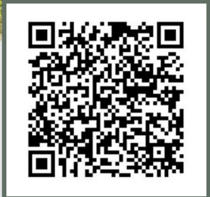
6 Linden Place, Station Approach East Horsley, Surrey KT24 6QB