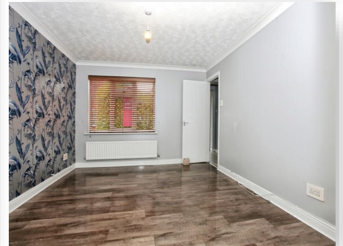
Mansfield Court, Peterborough PE1 4NE