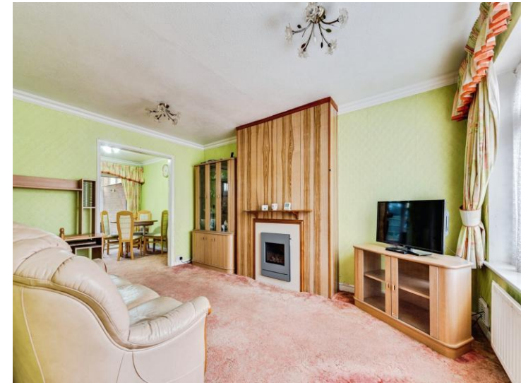
Whitehorns Way, Drayton, ABINGDON, OX14 4LJ