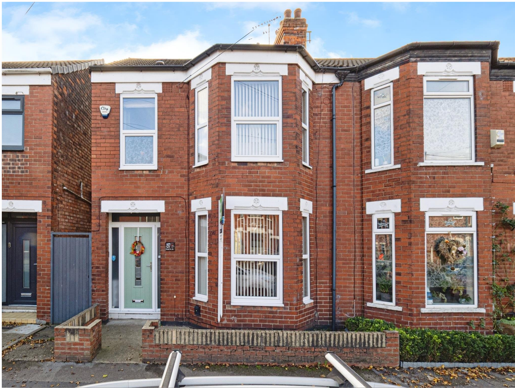
Summergangs Road, Hull, HU8 8JY