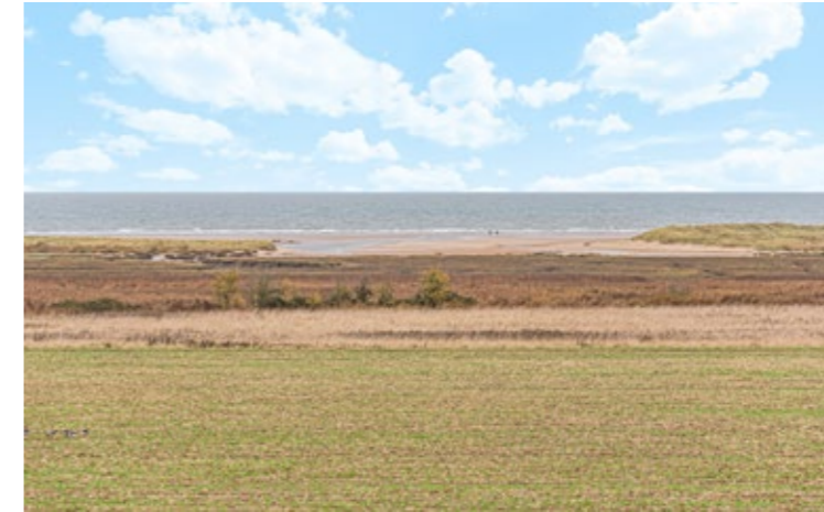
Titchwell marsh, April 2024

“Our favourite place to explore nearby is Titchwell RSPB, it has lovely walks and bird watching opportunities.”