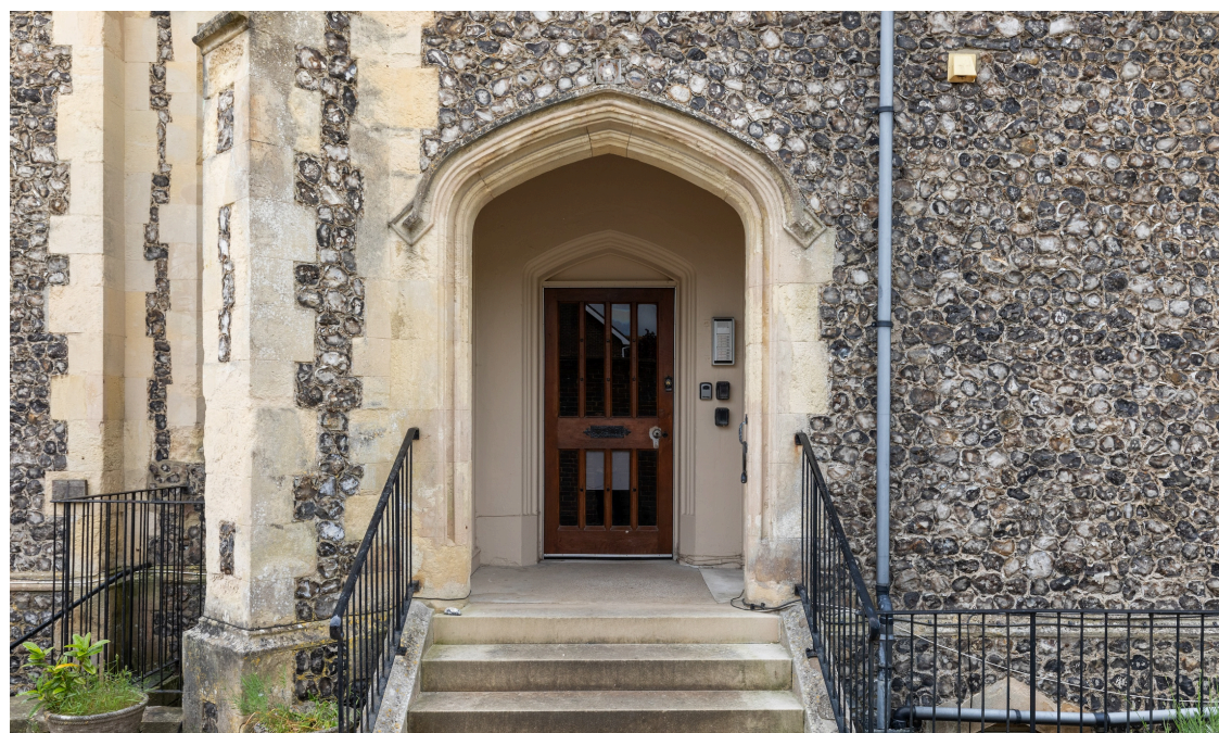
Shoreham Court, The Close, Shoreham by Sea, BN43 5AR Offers Over £200,000