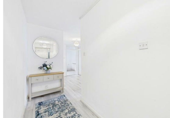
Entrance Hall 4'1" x 10'10" (1.27m x 3.32m)