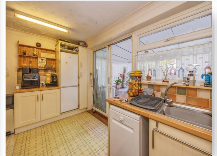
Cornbrook Grove, Waterlooville PO7 8RD