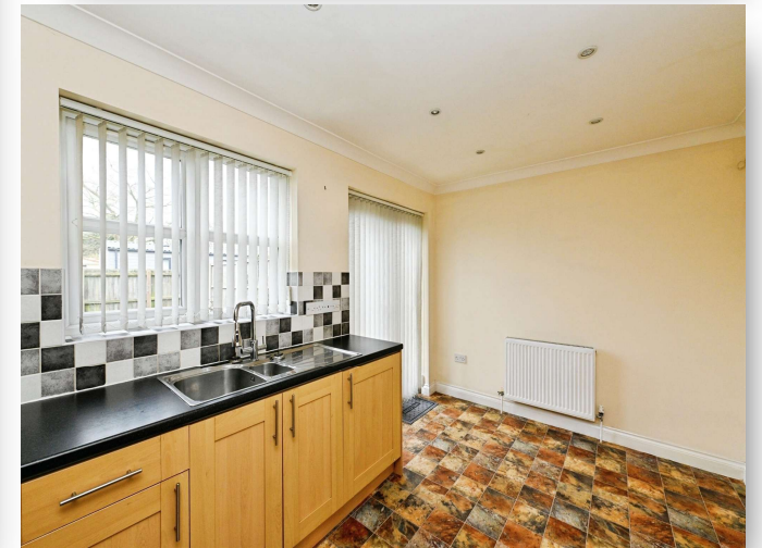
Main Road, Three Holes, Wisbech, PE14 9JR