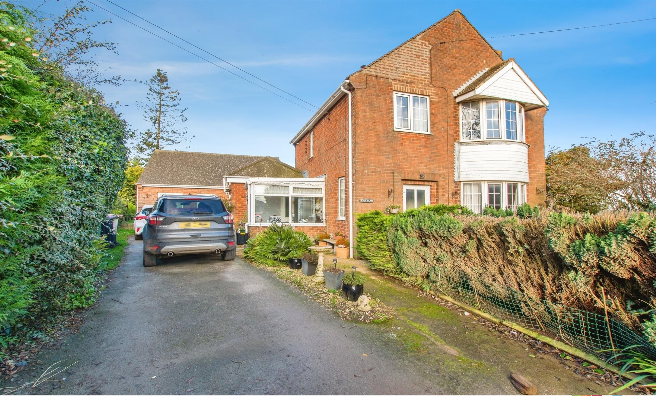
Katron Long Hedges, Fishtoft Boston PE22 0RH