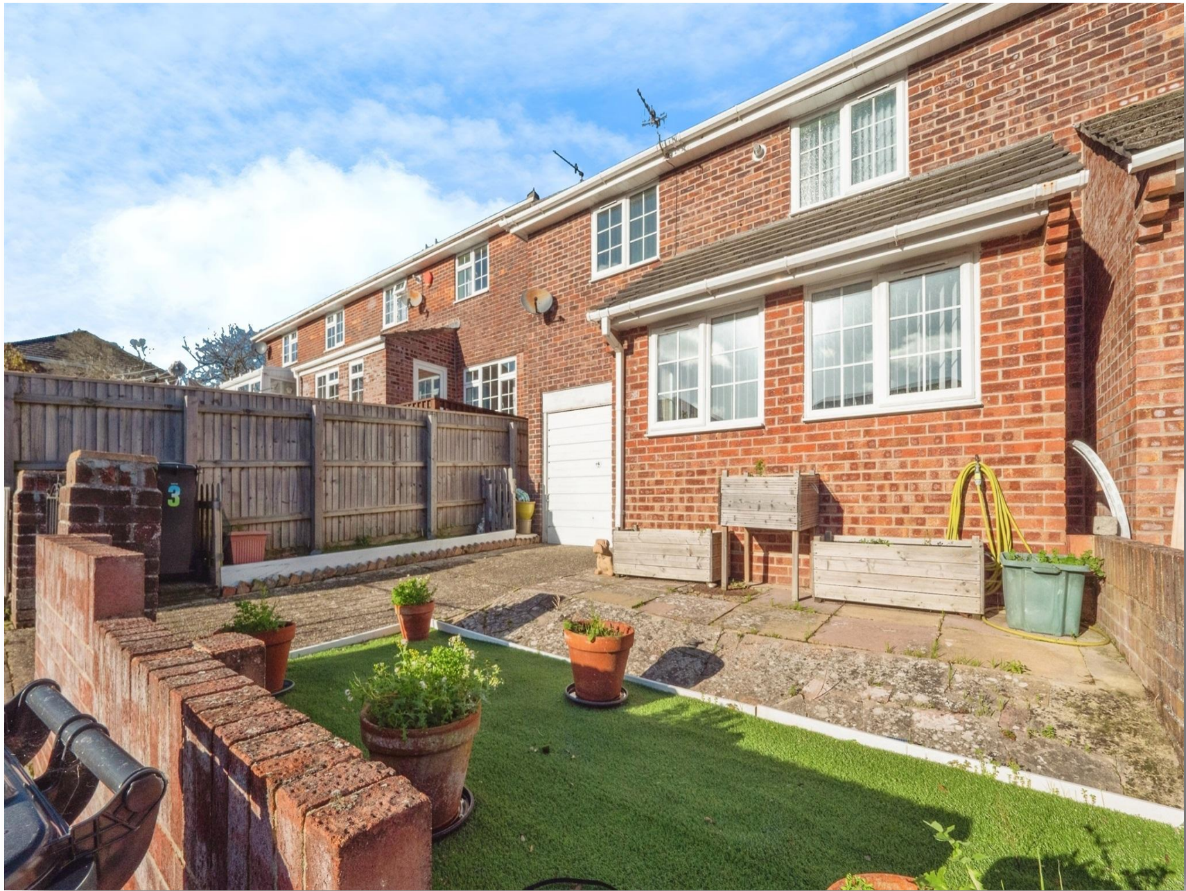
Windsor Road, WEYMOUTH DT3 5PQ