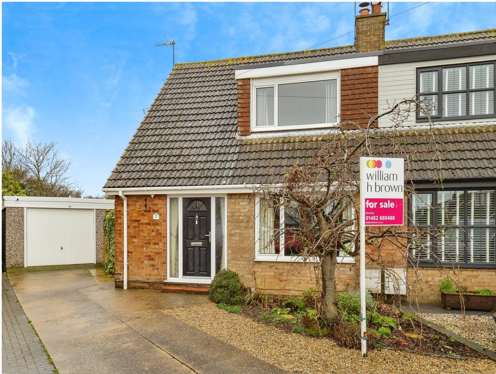
Cawood Crescent, Skirlaugh, Hull, HU11 5EW