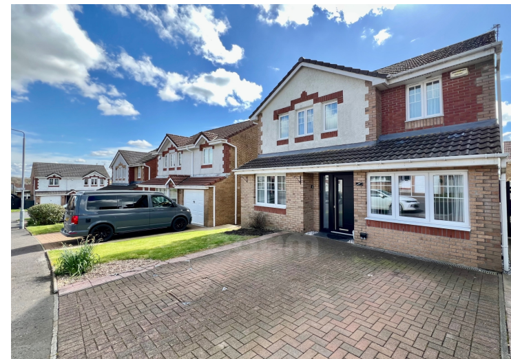
Kittyshaw Place, Dalry