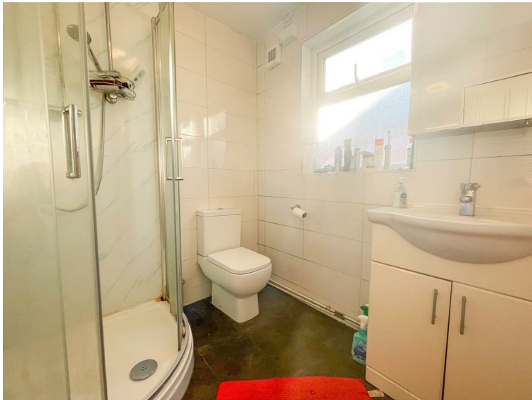
SHOWER ROOM 6'11" x 5'10" (2.12 x 1.78) Vanity unit, shower cubicle with mains shower, low level W/C, heated towel rail, tiled walls, frosted double glazed window to side aspect.