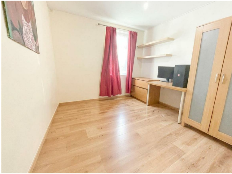
BEDROOM THREE 13'7" max reducing to 9'2" x 8'11" (4.16 max reducing to 2.80 x 2.74) Radiator, double glazed window to rear aspect.