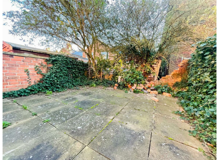
OUTSIDE Paved courtyard garden. Gate to front aspect.