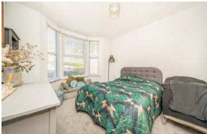
Priolo Road, SE7