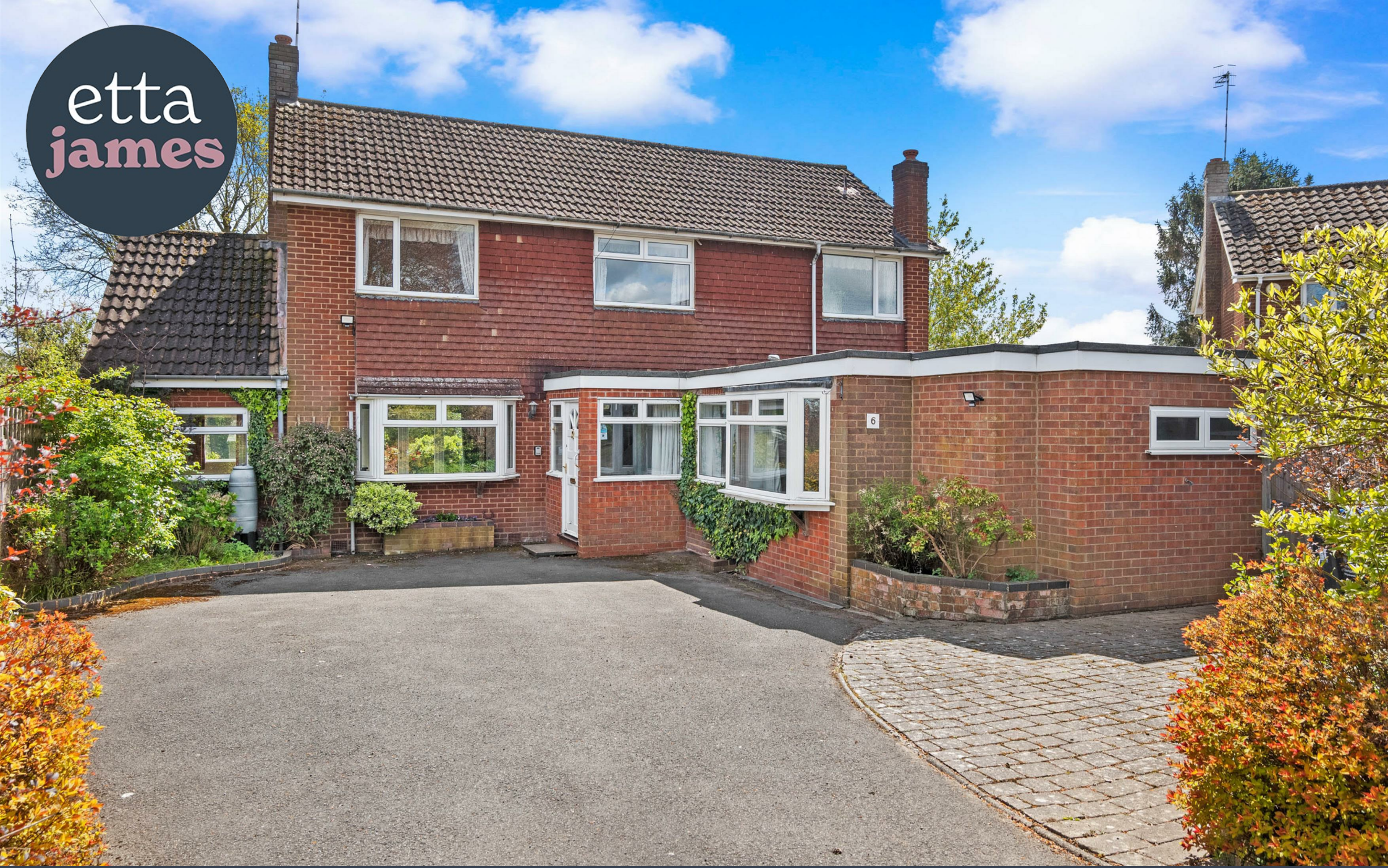
ELMDENE CLOSE, WARWICK, CV35 8XL