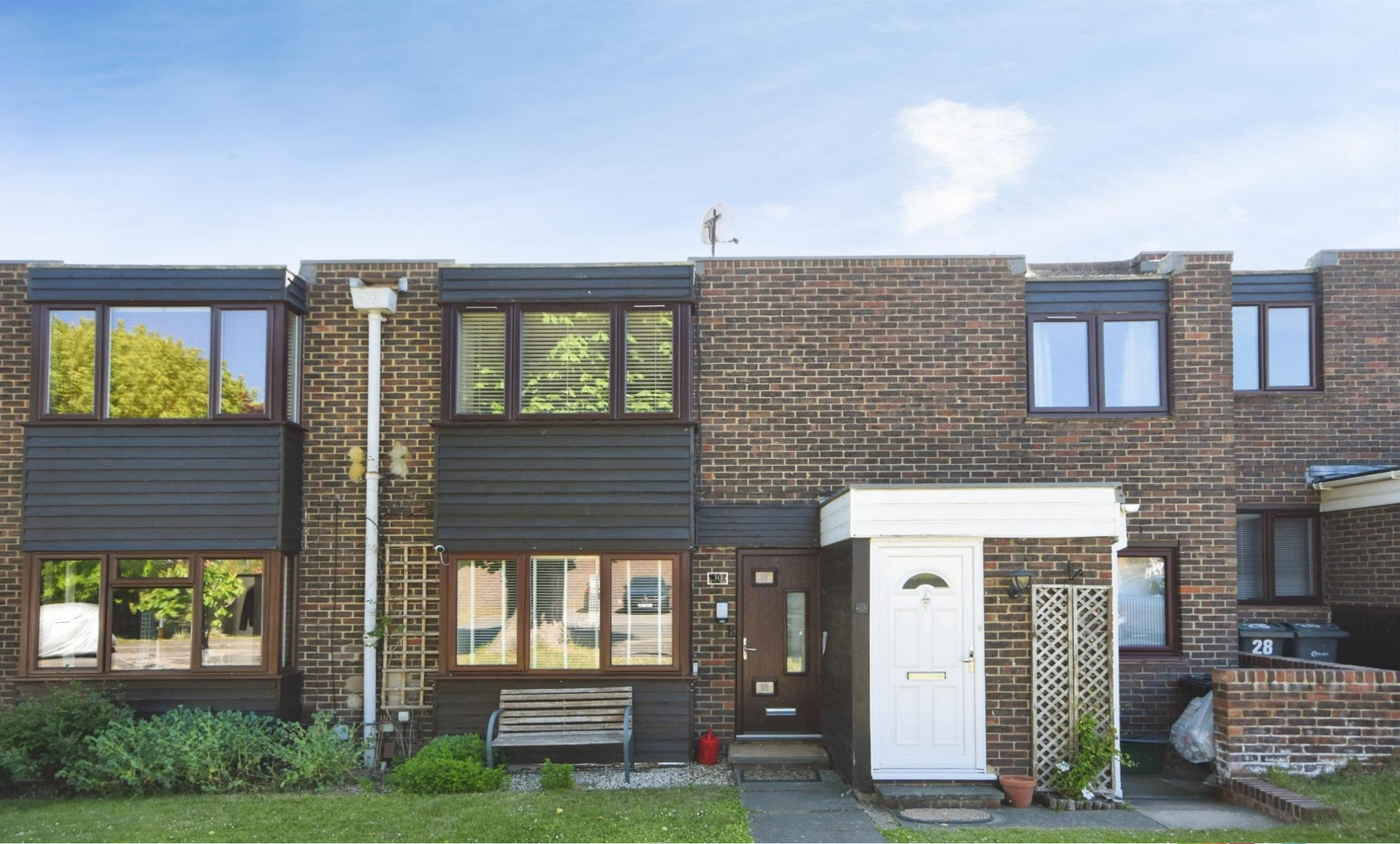
Wood Dale, Great Baddow Chelmsford CM2 8EZ