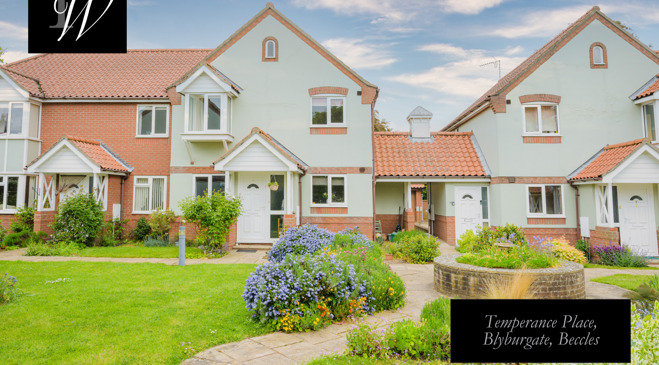
Temperance Place, Blyburgate, Beccles