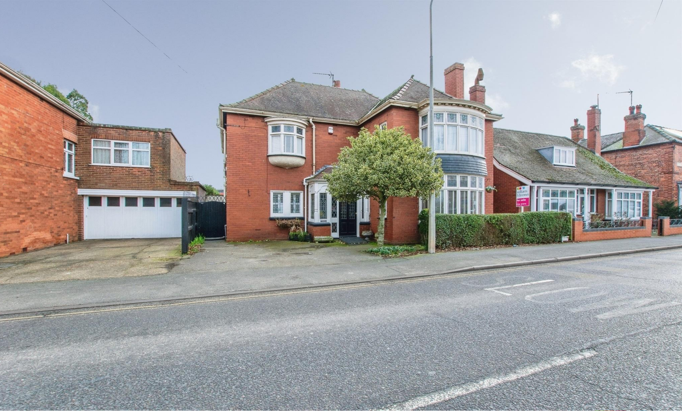
Tawney Street, Boston PE21 6PA