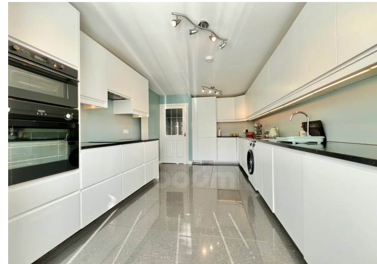
Kittyshaw Place, Dalry