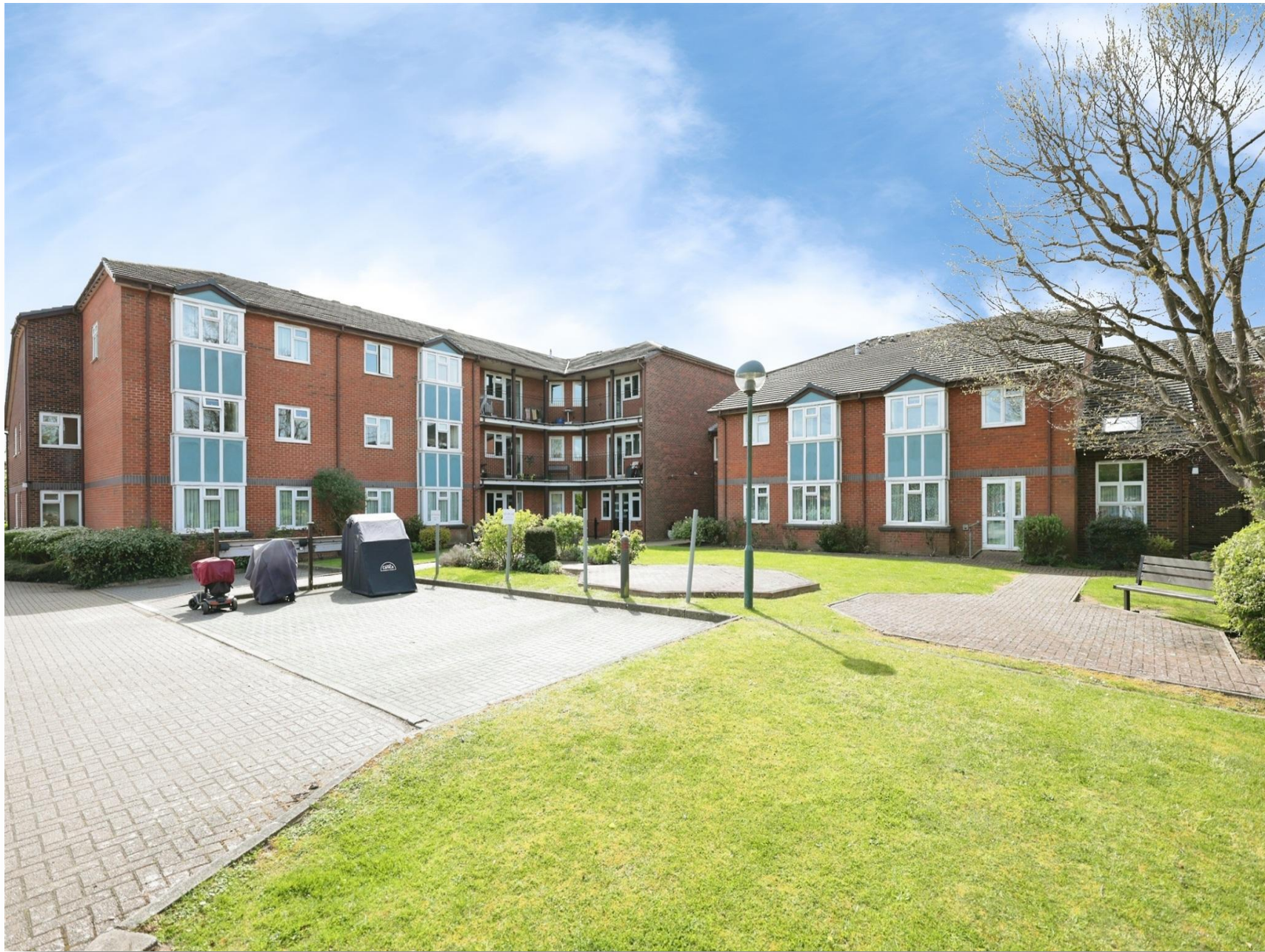
Fairbanks Lodge, Furzehill Road, Borehamwood, WD6 2DQ