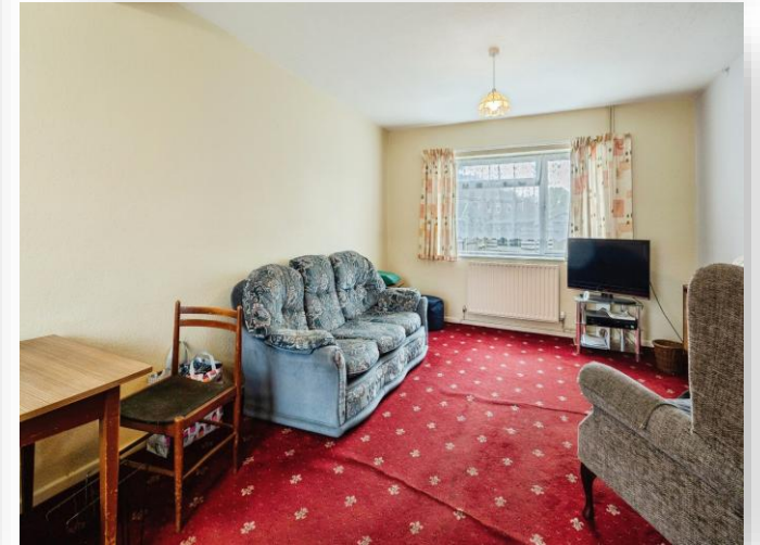
Hermitage Road, Loughborough