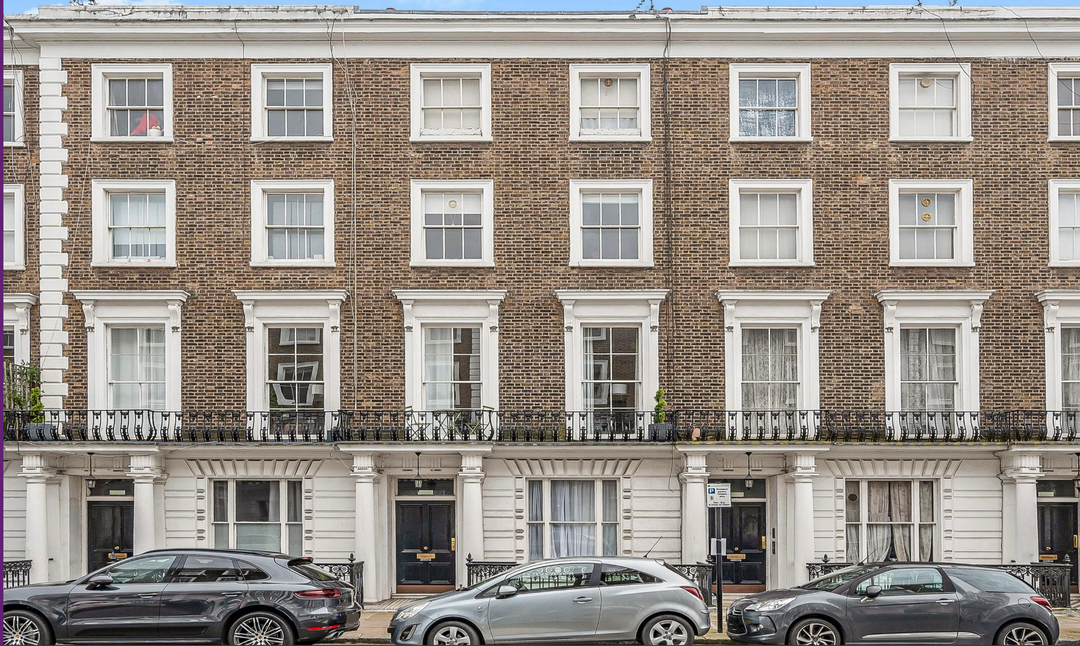
Orsett Terrace London, W2